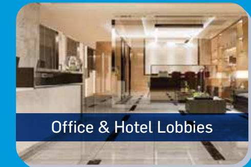
Office & Hotel Lobbies