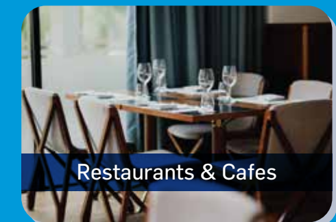
Restaurants & Cafes