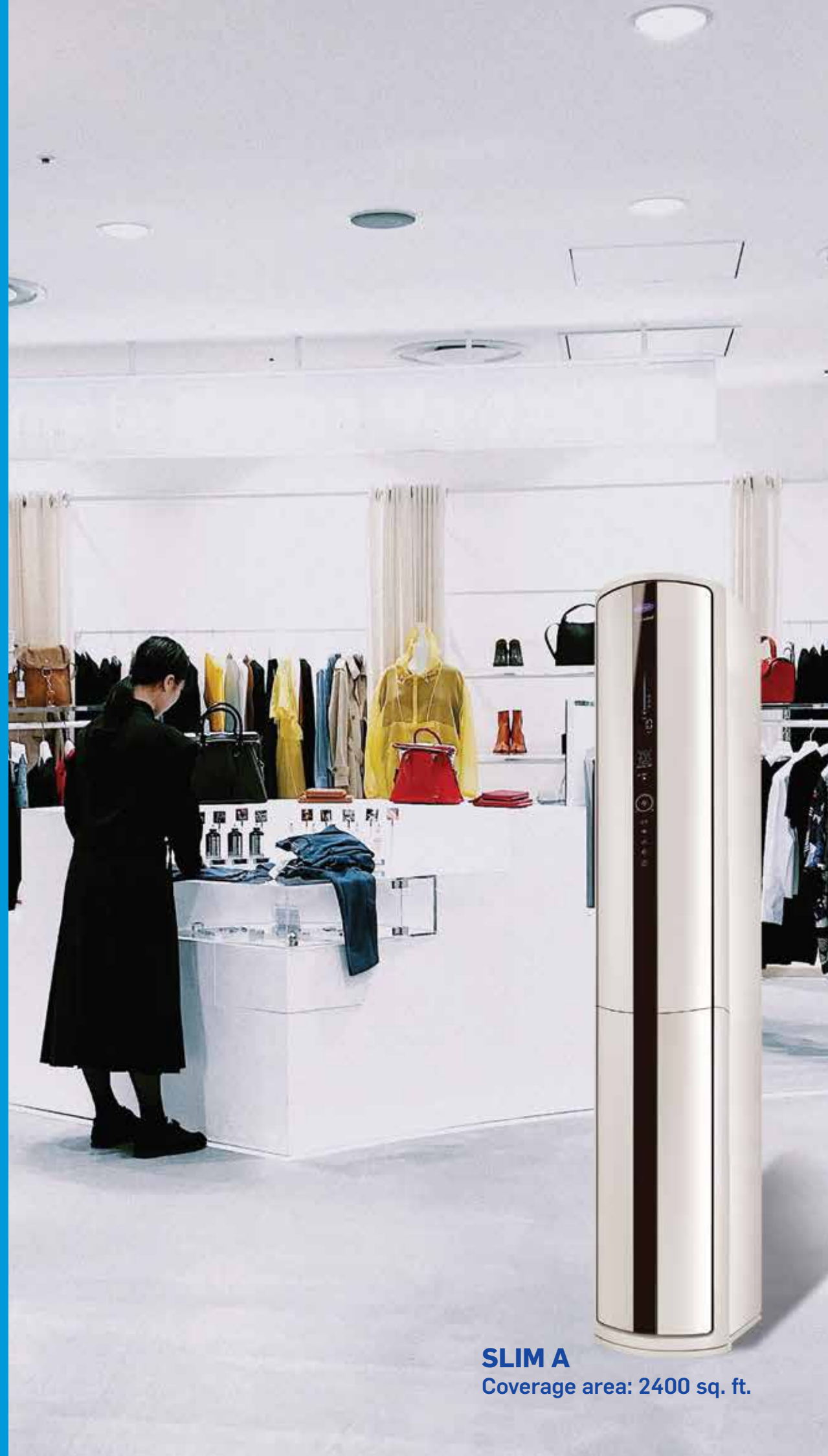
SLIM A Coverage area: 2400 sq. ft.

*Tested with Influenza virus A (H3N2): 99.99% reduction Korea Testing & Research Institute